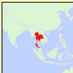
South East Asia

This proportional symbol map represents the number of commercial banks per province. The provinces surrounding Bangkok have the highest number of commercial banks. This can be explained by the fact that Bangkok is the economic center of Thailand.