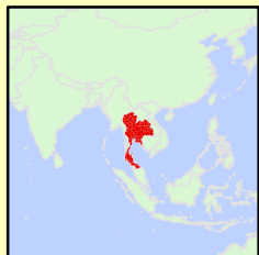
South East Asia

This map depicts the number of motorcycles in Thailand by changwat based on information from the 2002 record of the number of motorcycles registered under the Motor Car Act. The graduated symbols visually represent each changwat's number of motorcycles, and the numerical range of each dot is explained in the legend.