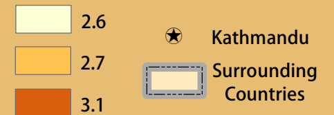
Education Median Years of Schooling

This map has been produced by Calvin College, Department of Geography, and Environmental Studies. It is provided free of any charge as a service to global communities and can be distributed freely. Changes and alterations are not allowed. No warranty is given for this map as to accuracy and is based on available data. Created in Spring 2011.