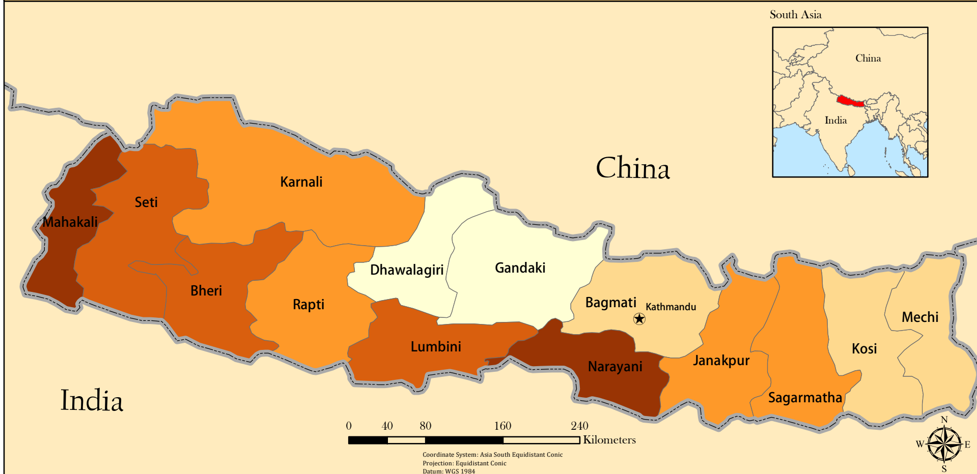
Head of Household, by Development Region