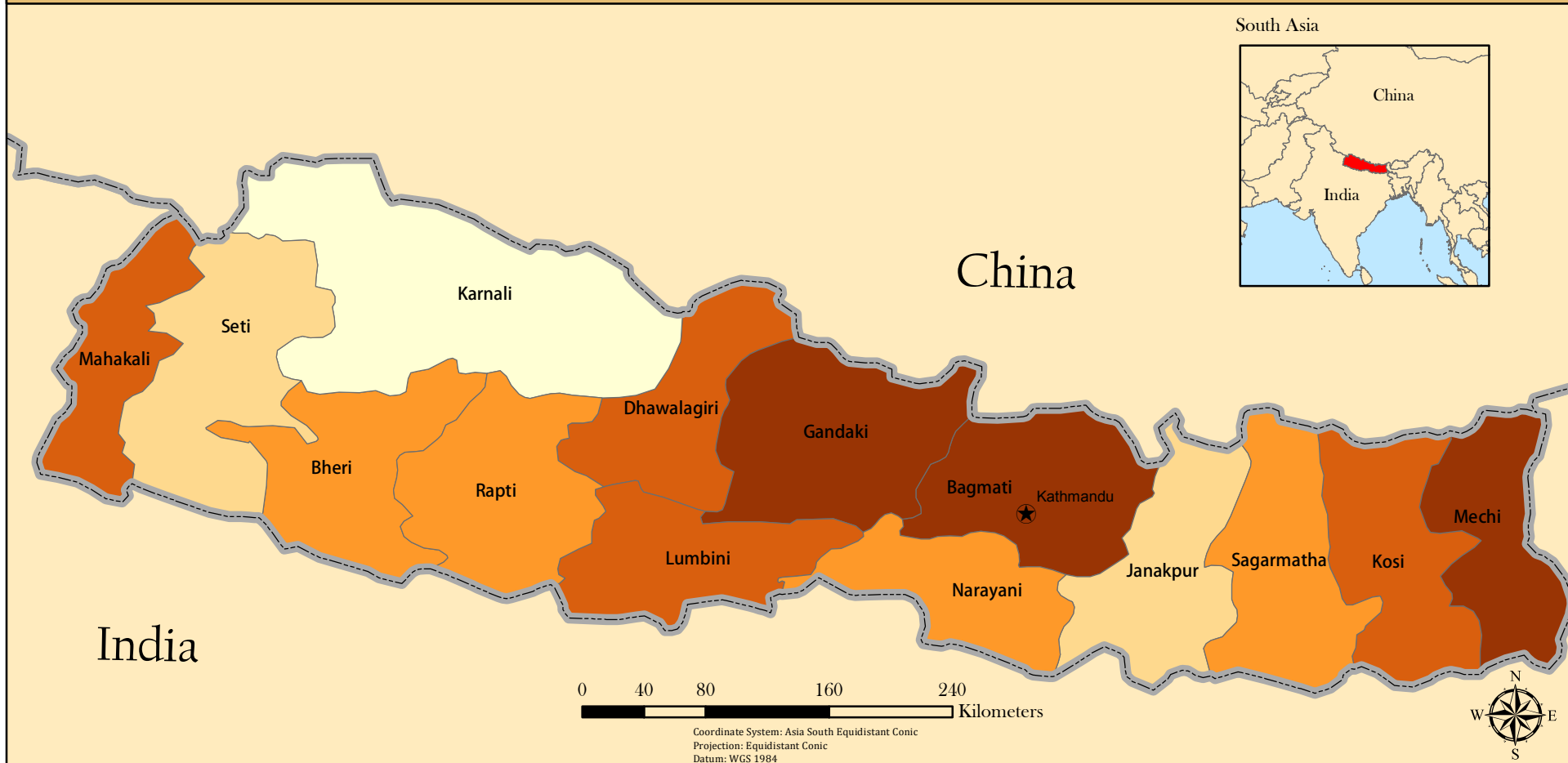
Percentage of those who can Read and Write, by gender